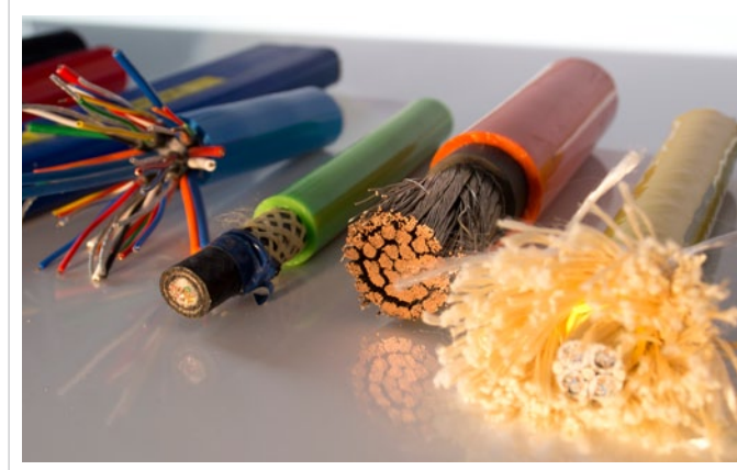
Bespoke subsea cable design configurations

Our Electrical Engineers and Technicians are fully trained and certified on our equipment by City & Guilds.