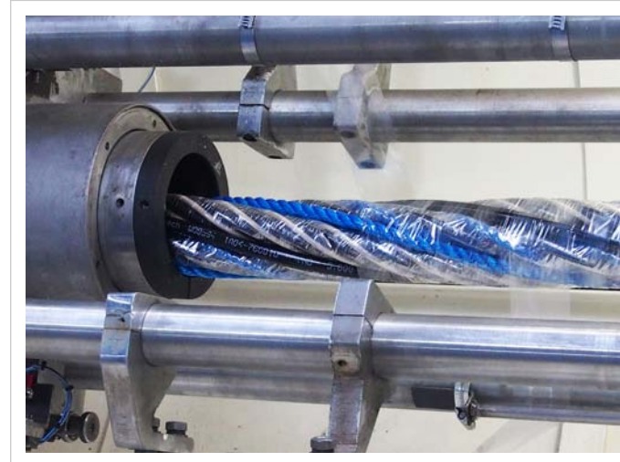
Twisted hose, cable, rope bundle / extruded polymer sheathing

Hose bundles with such properties are used in many applications for the offshore subsea oil & gas industry.